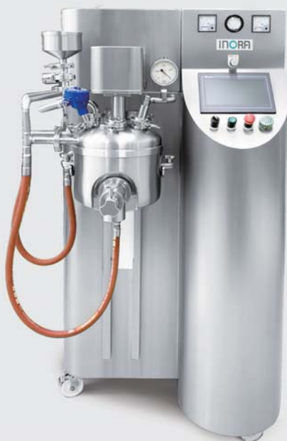
實驗型 Laboratory Size